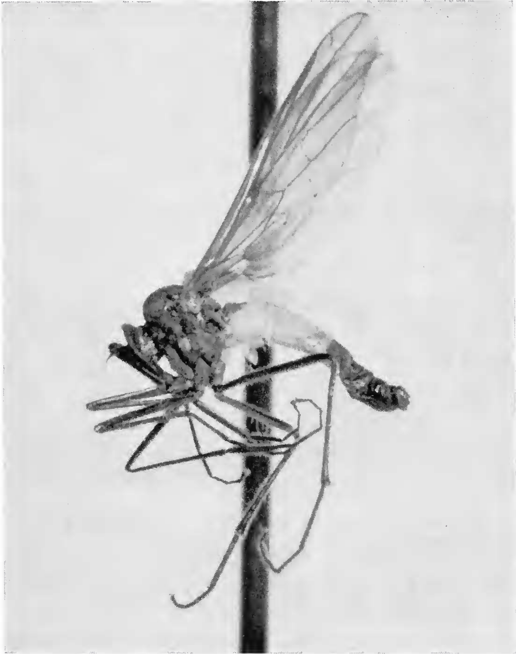
Fig. 1. Empis melanderi , new species, left lateral view, male (paratype).

This new species interestingly displays dimorphism in abdominal coloration. This feature distinguishes it from all other Nearctic species. The male has a bicolored abdomen, a contrasting white and black (in life), while the female has a unicolored black abdomen. Dr. A. L. Melander, who first distinguished this Empis as new, determined the males as Empis n. sp. and the females as Acallomyia n. sp. (a subgenus of Empis ). Because of the need for a new subgeneric classification of Empis and allied genera, and the difficulty of assignment of this new species to an existing subgenus, this assignment is not attempted at this time. It is our pleasure to dedicate this new Empis to the late Dr. Axel Leonard Melander (1878–1962), a pioneer worker on the